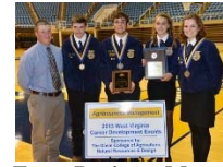
Farm Business Mgmt