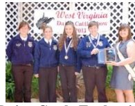
Dairy Cattle Evaluation