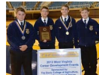
7 th & 8 th Agriscience