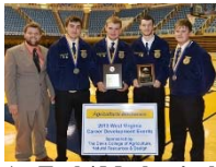
Ag Tech/ Mechanical