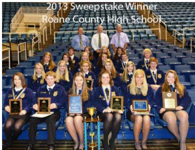
WV Sweepstakes Winner – Roane County HS